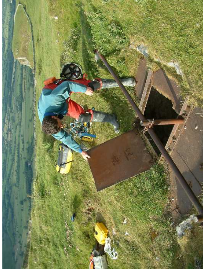
The entrance to Rowter Hole (before the new lid was installed).